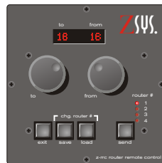
Up to four units can be controlled from optional z-rrc Router Remote Controller

Are you getting tired of crawling behind your rack of digital gear every time you want to re-configure your signal flow? Are you troubled by the snake-pit of digital cables under your console? Do you wish you could control your digital signal flow from the same PC or Mac on which you run your digital audio workstation? Then you need a Digital Detangler Pro.