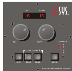
Up to four units can be controlled from optional z-rrc Router Remote Controller

Are you getting tired of crawling behind your rack of digital gear every time you want to re-configure your signal flow? Are you troubled by the snake-pit of digital cables under your console? Do you wish you could control your digital signal flow from the same PC or Mac on which you run your digital audio workstations? Then you need a Digital Detangler Pro.